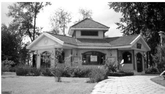
The seat of Thaqib Astronomical Society in Mellat park, Rasht, Iran

At present there is an analemmatic sundial (shown above) in this park that attracts many visitors to the park. The members of the Sundial Group (mostly young schoolgirls) plan to study the history along with mathematical, astronomical and artistic aspects of sundials, which provide them with a concrete application of the mathematical courses, especially trigonometry. They are supposed to be in charge of designing several sundials for the cultural buildings in the whole province in future. Any comments or communications may be sent to to: Sundial Group, Thaqib Astronomical Society, P.O. Box 13145-1785, Tehran, IRAN