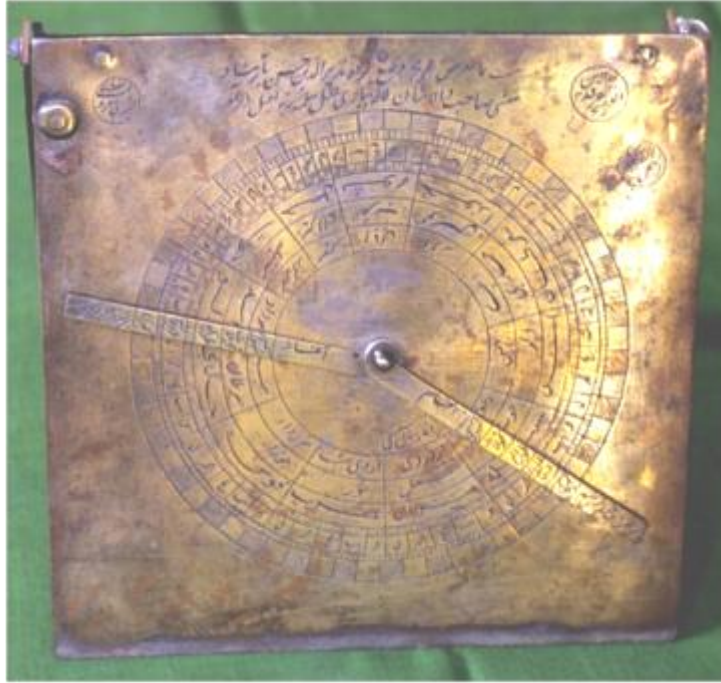
Fig. 4: Shabnumā-wa-Rūznumā , Observe showing the Shabnumā Khuda Bakhsh Oriental Public Library, Patna.

The obverse side of the plate is engraved as the Shabnumā or the night indicator (Fig. 4). There are eight concentric circles forming seven annuli. At the centre are pivoted two copper strips, measuring 95 and 90 mm respectively. These function as the indices. On these are engraved the arguments of the annuli, i.e. labels explaining the divisions marked on the seven annuli. For the sake of reference, we divide the circles into 360° from the topmost point.