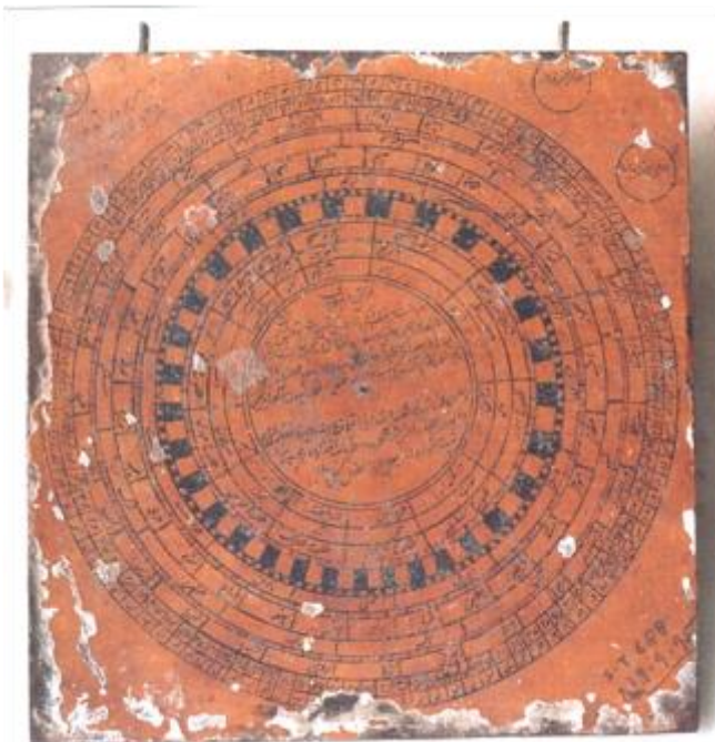
Fig. 6: Shabnumā-wa-Rūznumā , Observe showing the Shabnumā Raza Library, Rampur.

Arabic names of the zodiac signs with a prefix ṭulū c (rising) meaning signs in ascendance.