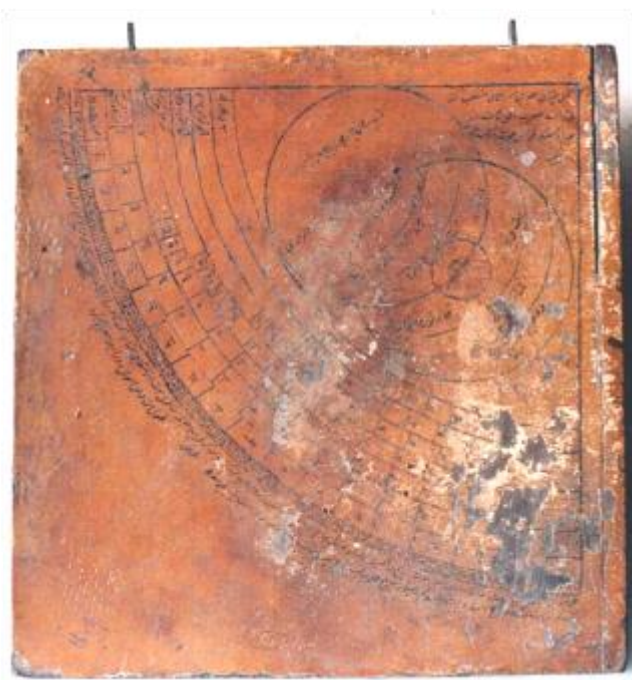
Fig. 7: Shabnumā-wa-Rūznumā , Reverse showing a Horary Quadrant as the Rūznumā. Raza Library, Rampur.

Each of these scales is used for one or two months. Depending on the length of the day in the corresponding solar month, these scales are divided into so many number of ghaṭīs as there are in half a day of that month. Thus when the sun is in Cancer, the day is the longest. It has the duration of 34 ghaṭīs (= 13 hours 36 minutes). The scale for this month is divided into 17 ghaṭīs , which is the length of half a day. When the sun is in Capricorn, the days are the shortest: 24 ghaṭīs (= 9 hours 36 minutes). Accordingly the scale is divided into 12 ghaṭīs .