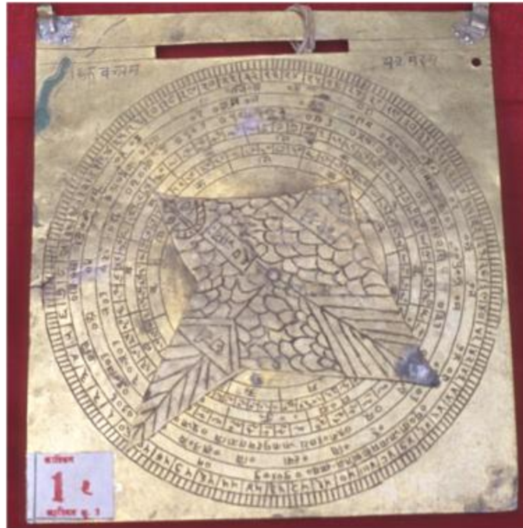
Fig. 1: Dhruvabhrama-yantra , Obverse showing the Dhruvabhrama Jai Singh's Observatory, Jaipur

signs, their sub-divisions, and also the lunar mansions ( nakṣatras ) pertaining to these two sets.