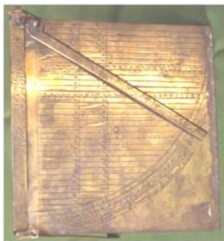
Fig. 5: Shabnumā-wa-Rūznumā , Reverse showing the Rūznumā Khuda Bakhsh Oriental Public Library, Patna

ma'kūs (umbra versa in [seven] feet), the lower one zill asābi c ma'kūs (umbra versa in [twelve] digits). On these horizontal lines the perpendiculars are numbered in Abjad (Arabic alphanumerical) letters, on the upper line from 1 to 30 and on the lower line from 1 to 28 (in both cases starting from the vertical radius). Horizontal parallels are not drawn, but they are marked on two vertical scales (i.e. nos. 7 and 12, as counted from the vertical radius). On these vertical scales, the horizontal parallels are numbered in Persian numerals. The seventh horizontal parallel is labelled as zill aqdām mustawī (umbra recta in [seven] feet) and the twelfth parallel zill asābi c mustawī (umbra recta in [twelve] digits). Thus the sine quadrant incorporates the shadow squares of 7 and 12 units which are usually engraved on the back of the astrolabe. 1