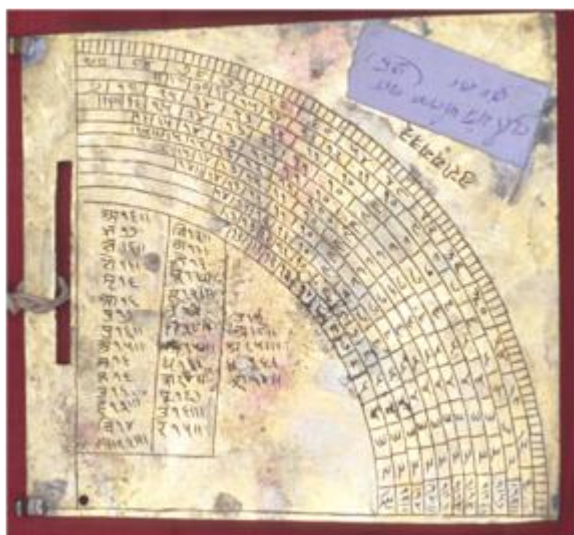
Fig. 2: Dhruvabhrama-yantra , Reverse showing the Horary Quadrant, Jai Singh's Observatory, Jaipur

About twenty specimens of the Dhruvabhrama-yantra are extant in different collections in India, Europe and the US. In 2010, a nice specimen came for auction at the Sotheby's of London (Sotheby's, lot 125, pp. 90-91). In these specimens, there is much variation, not only in the outer form of the plate and the design of the four-armed index, but also in the configuration of the concentric scales. Although Padmanābha prescribes that the reverse side should be prepared as a sine quadrant (Fig. 3), there are also specimens which contain a horary quadrant instead of the sine quadrant (Fig. 2).